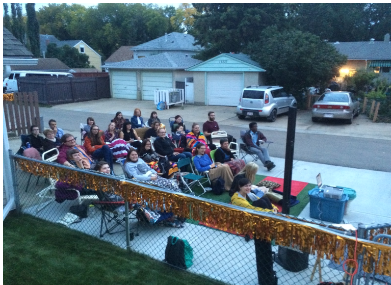
2016 Artists-in-Residence hosting visitors in Studio for Tennis Club's Bring-Your-Own-Lawnchair: Movie Night screening of Clueless and group discussion.

Calling artists of all disciplines to apply for the McLuhan House Artist Studio Residency Program. Please send an application including portfolio of images, Letter of proposal and CV to Arts Habitat by April 3rd at Midnight!