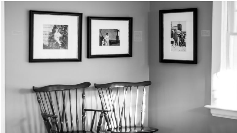
McLUHAN FAMILY PORTRAIT GALLERY