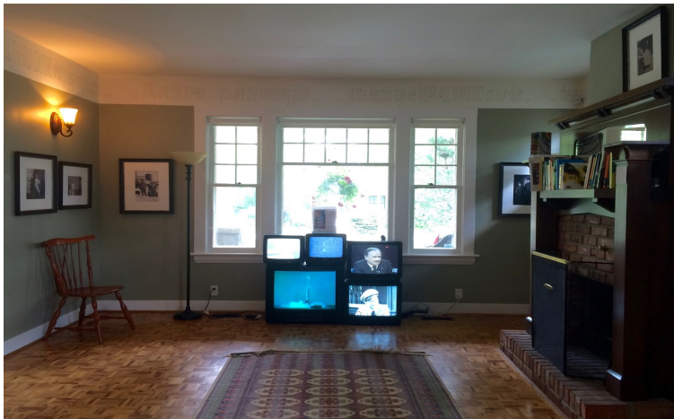
THE McLUHAN TV WALL